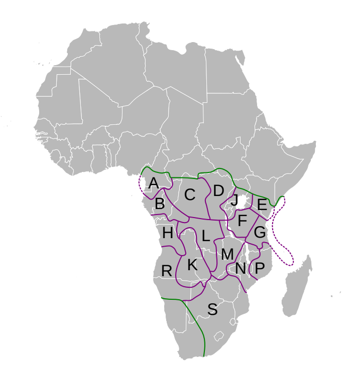
Figure 1: Guthrie's Bantu zones (with Tervuren's J zone)